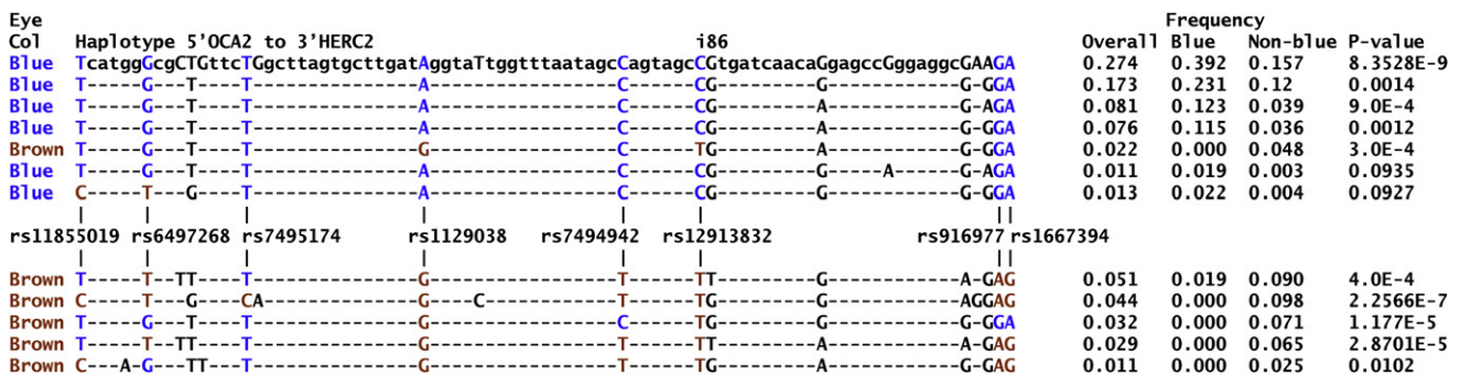
Figure 2. SNP Haplotypes Associated with Eye Color

An alignment of this interval across multiple species, concentrating especially on the regions close to our two peak SNPs, was also examined with the UCSC browser Multiz alignment track 30 and in the Vista Enhancer “Computational Dataset.” 31 The latter resource flagged only two regions of HERC2 as strongly conserved and thus likely to contain enhancer elements—portions of intron 2 (which contains no known SNPs) and intron 86 (containing rs12913832 and rs6497271). Although we observed little